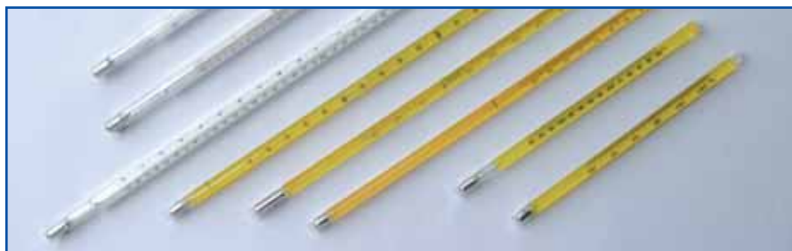
Precision laboratory thermometers

The protective coating is remarkable for its high transparency allowing easily legibility, for its temperature resistance (up to 250 °C) and hence sterilizability, and for a high degree of acid and alkali resistance (e.g. hydrofluoric acid).